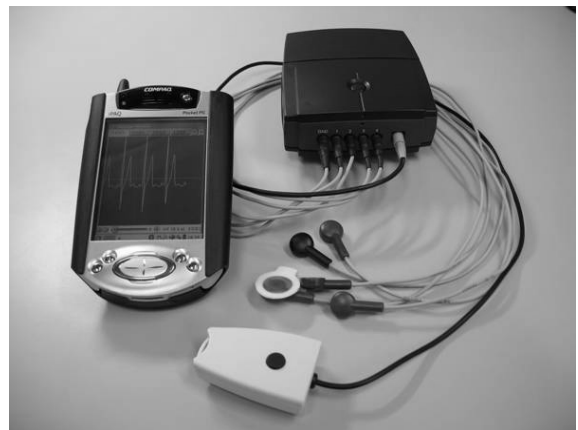
Figure 2 MobiHealth GPRS Pregnancy BAN

The BAN has been implemented using both front-end supported and self-supporting sensors. Fig. 2 shows the MobiHealth system with TMSI front-end sensors, configured for GPRS communication, while figure 3 shows the UMTS configurations (excluding the sensors). Both configurations use Bluetooth for intra-BAN