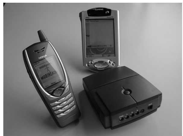
Figure 3 MobiHealth UMTS Trauma BAN

communication. The front-end also allows ZigBee [1] as an alternative intra-BAN communication technology.